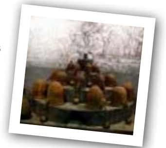
The distillation from 1400

Aladdin® Herb 37 is made by the distillation of 37 herbs, which is an ancient recipe, and using the ancient manufacturing process. Which dates back to 1516. This particular procedure was already being used in the 1400's. Various elixirs, were mainly used to treat damaged skin. In 1095 the monks, had been successfully using various herbal products to treat skin illnesses. The Aladdin® Herb 37 has brought back to the present this ancient process, and is the first in the world to use this in the beauty and skin health industry.